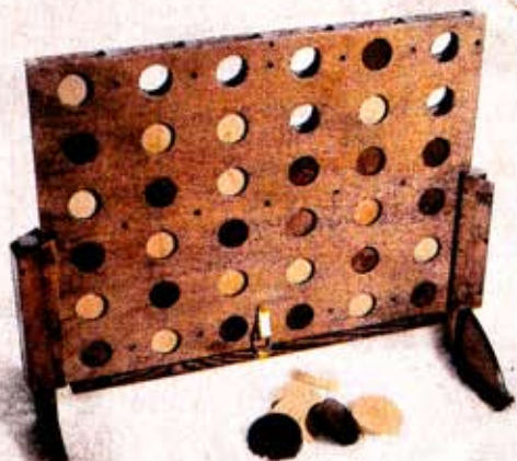
Before Xbox and virtual games, people played

By Rod Stafford Hagwood Fashion Columnist