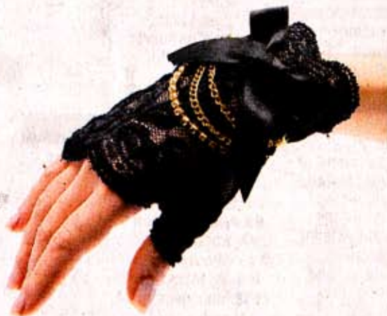
9 Madonna, Cyndi Lauper and Jody Watley