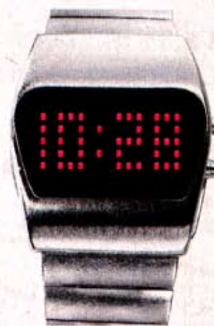
6 There was a time when digital watches looked hi-tech. Lucky has this modern version. $110; Macy's stores