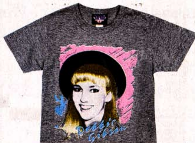
5 Only in your dreams: Retro T-shirts like this one of '80s teen queen Debbie Gibson ($14.99) or Miami Vice ($20). 80stees.com