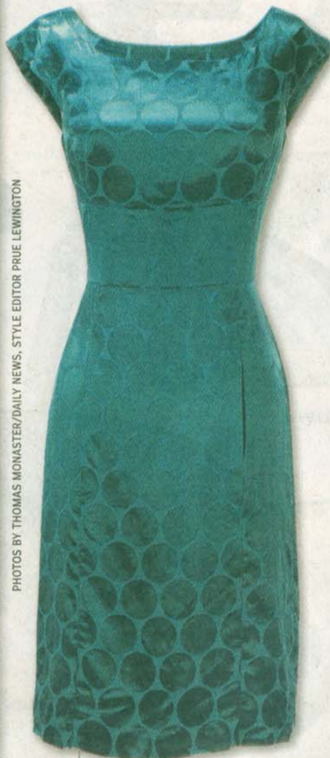
Sheath dress , $150 at Banana Republic