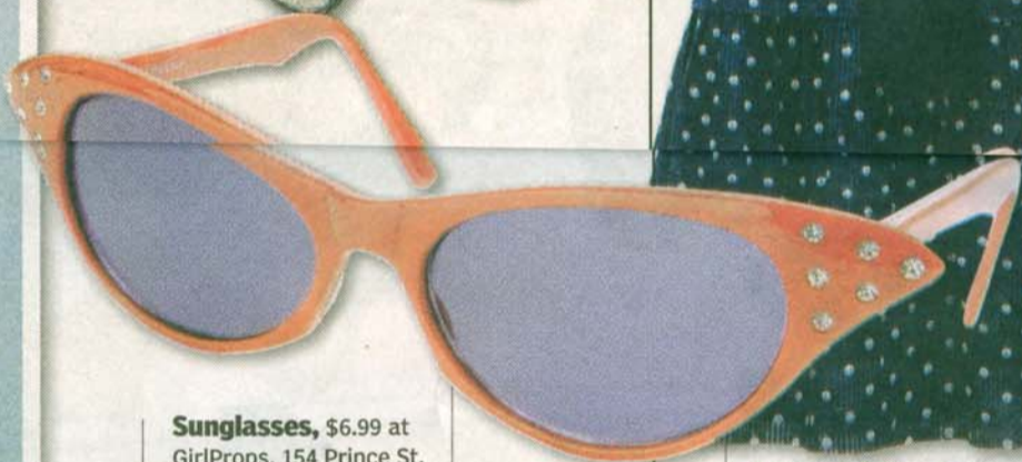
Sunglasses , $6.99 at GirlProps, 154 Prince St.