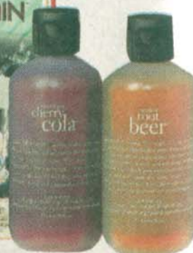
Philosophy shower gel three-pack , $30 at Saphora.com