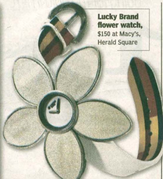
Lucky Brand flower watch , $150 at Macy's, Herald Square