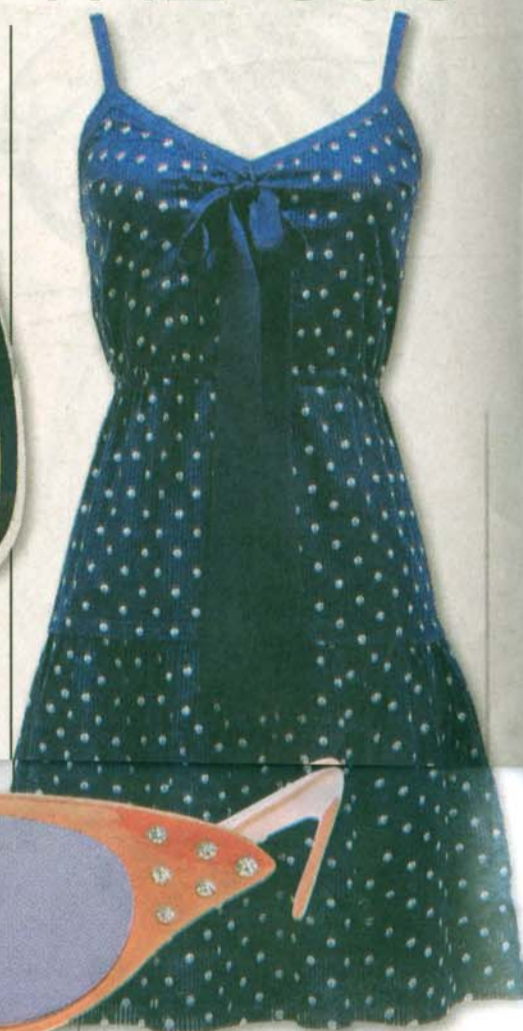
Polka-dot dress , $59.50 at American Eagle