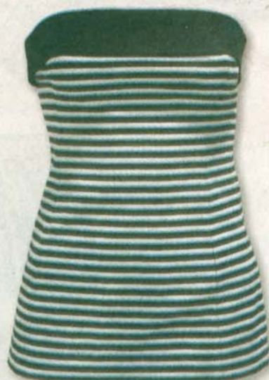
Strapless top , $19.99 at Zara